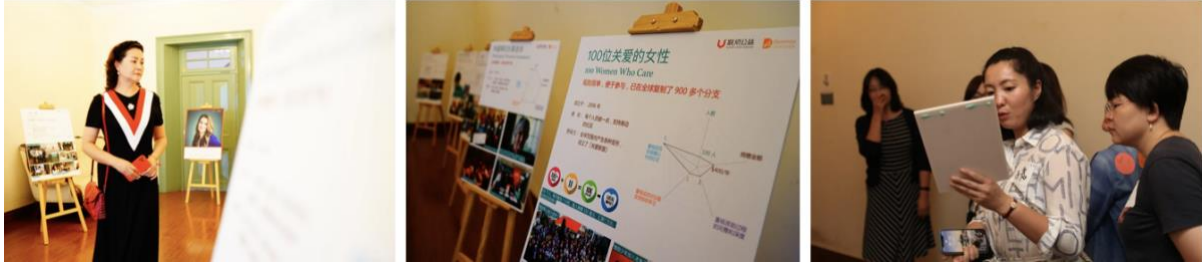
Photos of the Exhibition

Launched in 2006, the initiative of "100 Women WHO CARE" calls for 100 people to donate 100yuan for an hour-long meeting to help bring together 10,000yuan contribution to the development of the community. So far, more than 900 branches have been replicated around the world, and participants have expanded from women to men, teenagers, and children, etc.