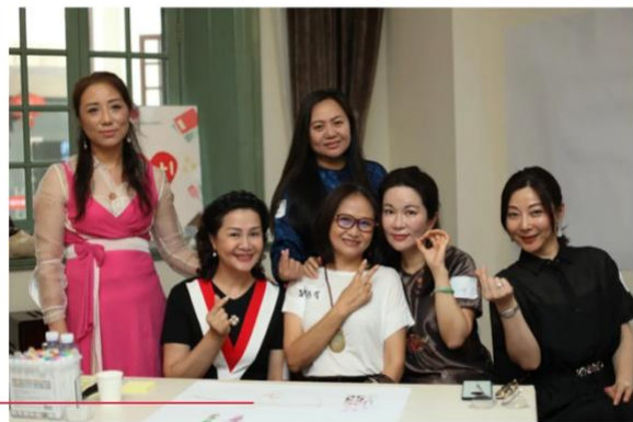
"250 Warm Hearts" Special Charity Fund of SUF