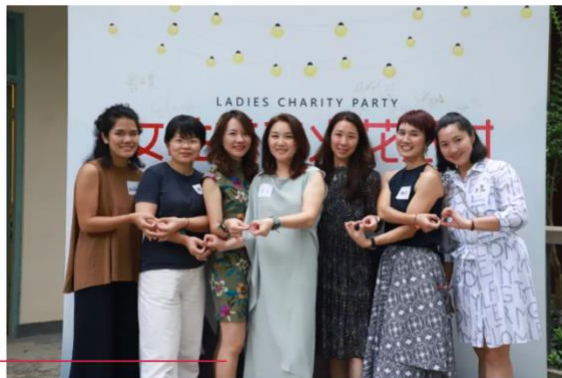
"She is Infinite" Special Charity Fund of SUF