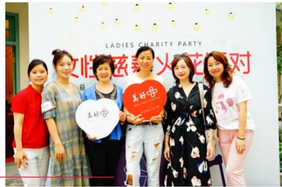
"Three and Philanthropy" Special Charity Fund of SUF

"The reason for such a name is that we firmly believe that people must maintain a pure and simple heart in doing philanthropy. Just do it 'silly', and don't do philanthropy with any utilitarianism. This name represents our attitudes toward philanthropy and our lives. We hope to find more "silly" partners."