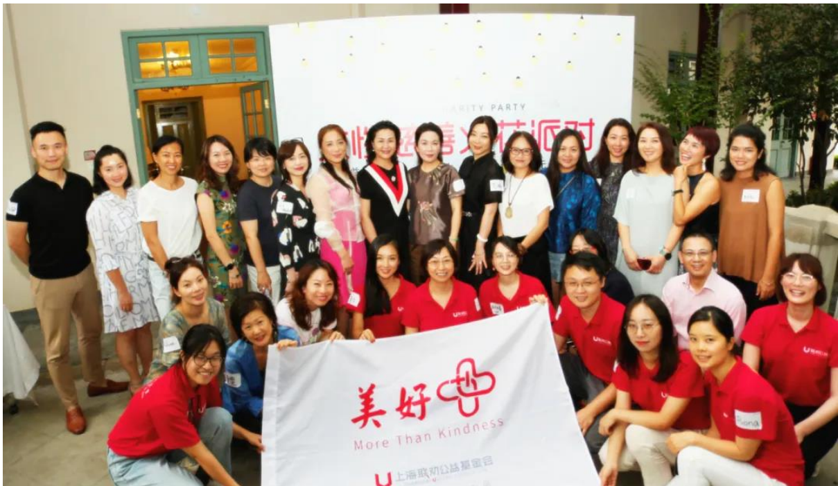
Photos of the Event

Participants also said that they had gained a deeper understanding of the power of women's philanthropy through this activity and hoped to unite more people in the future so that the multi-gender power can shine in the field of philanthropy and create more sparks.